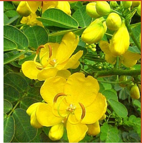
The christmas senna's bright yellow blooms draw a lot of attention in the fall.

Look for fall flowering plants like golden rain tree, cassia and night blooming jasmine. Deciduous